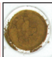
Leading Global Competitor 32 1,844 Hrs

HYDREX demonstrates significantly lower sludge formation – even at longer test hours – reflecting outstanding oil quality†