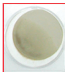
HYDREX AW 46 2,684 Hrs